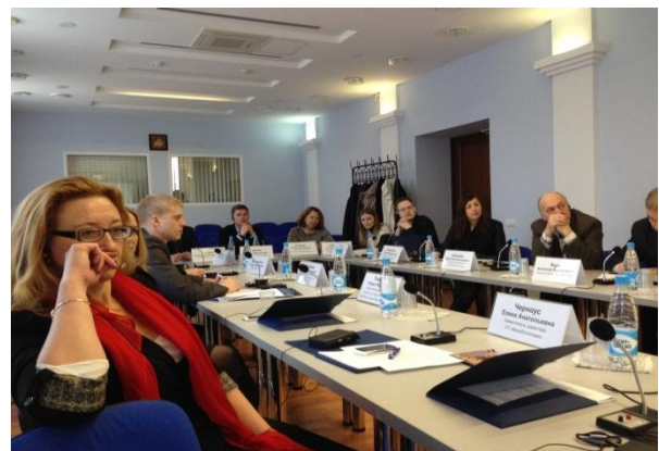
Seminar participants on March 28, 2014 in Minsk